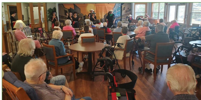
Prairie Hills Independence's community room was packed full to watch the Country Steppers for a Wild West get-together!