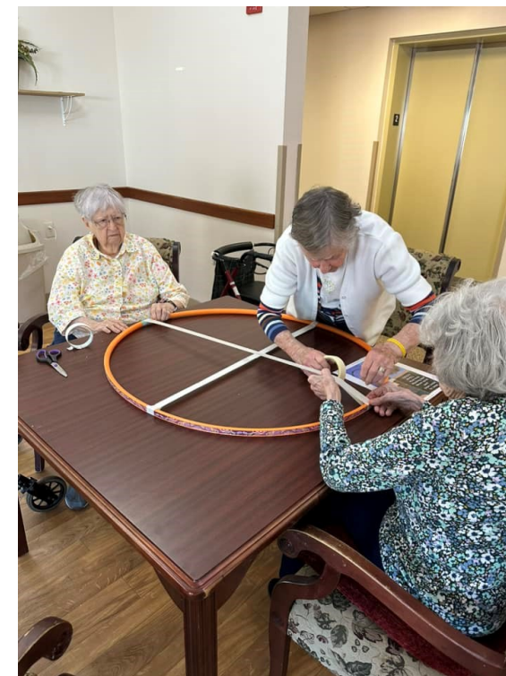
Residents working on a Wagon Wheel Craft!