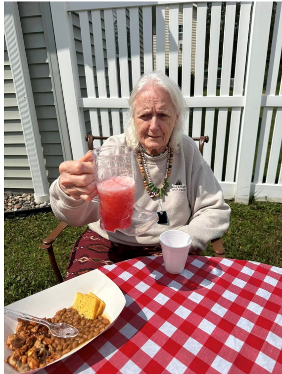
Nothing is better than enjoying a picnic outside on a beautiful day!