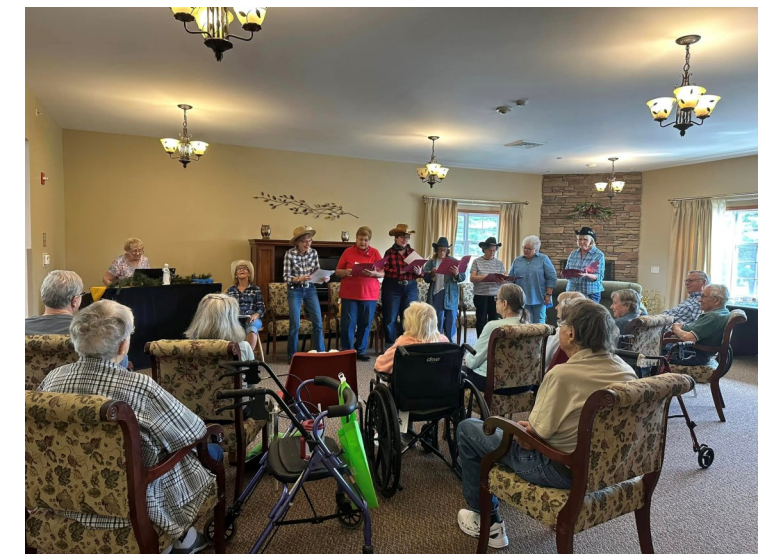
Everyone is enjoyed the wonderful music from "Voices of Praise!"