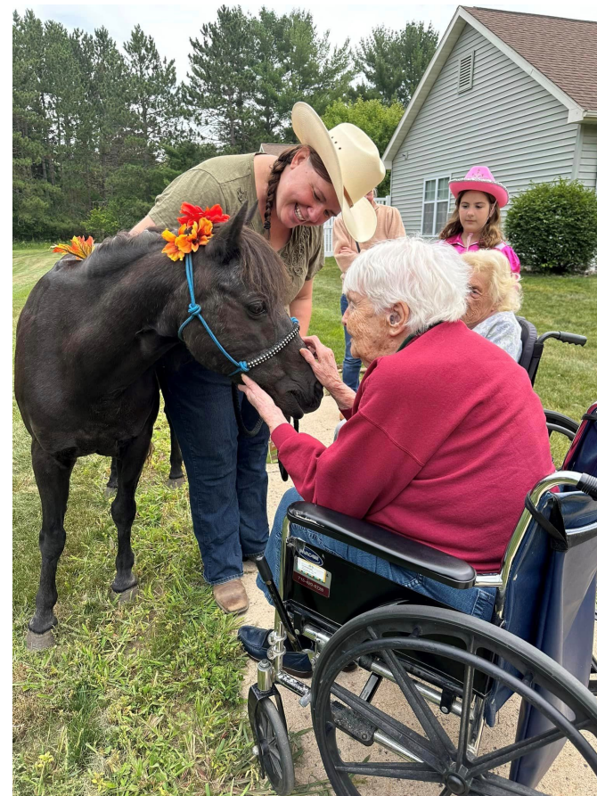
Everyone LOVED saying Hi to our new pony friend, Mercy!