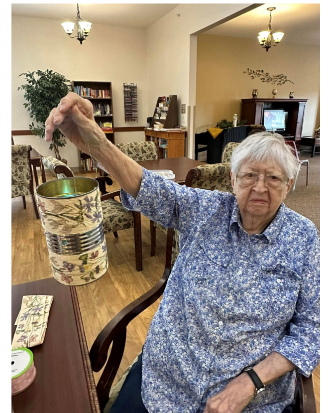
We got crafty and made tin can lanterns!