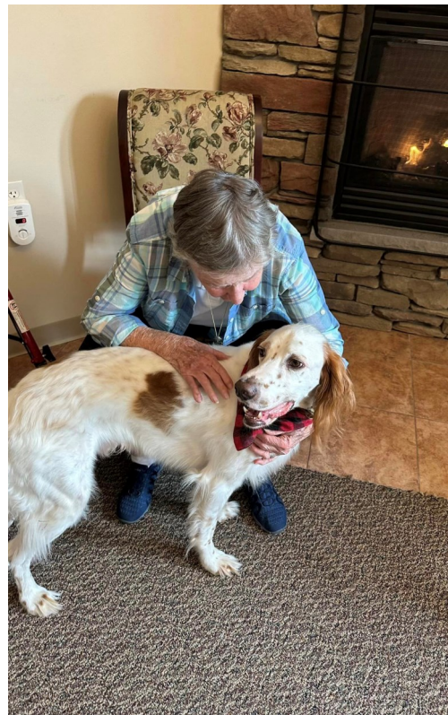
Nothing like Puppy Love!