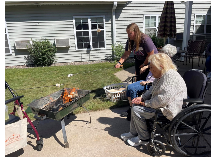
Cooking smores on National Smores Day!