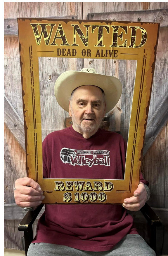
Resident's had a blast making 'Wanted' Posters.