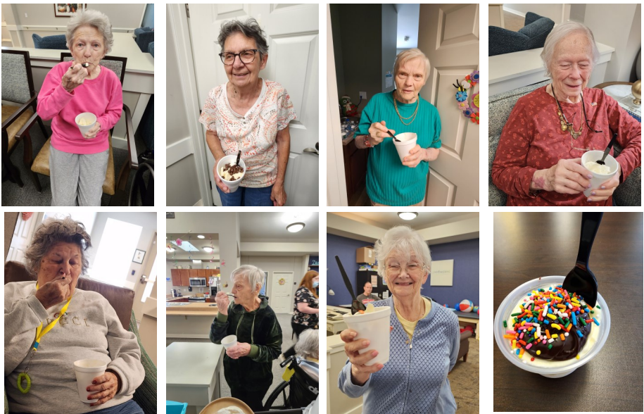
We are all enjoying our Ice Cream Sundae's