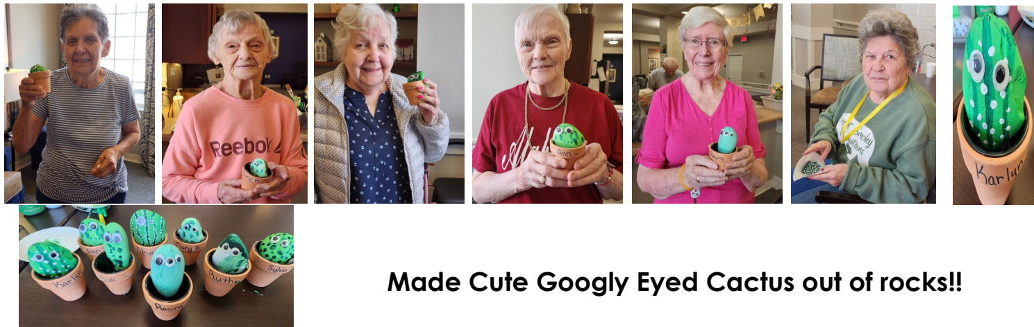
Made Cute Googly Eyed Cactus out of rocks!!