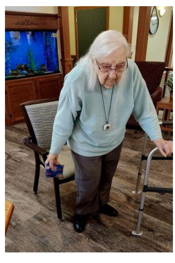
Playing games exercises our bodies and our minds and keeps us young and strong.